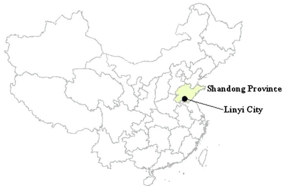
Fig. 1 Location of Linyi City in China. The current study examined the relationship between meteorological factors and epidemiological pattern of Japanese encephalitis in Linyi City during 1956–2004

residuals. The effect of mass vaccination on JE incidence was also evaluated using a transfer function in the time series analysis (Helfenstein 1991; Upshur et al. 1999). Mass vaccination began in Linyi since 1970. Without information on the detailed time frame of the vaccination strategies, we simply treated vaccination as an indicator variable, coded as 0 for pre-1970 and 1 for post-1970, respectively. Transfer functions have two possible parameters. The first parameter, \omega , is the magnitude of the asymptotic change in level after intervention. The second parameter, \delta , reflects the onset of the change, the rate at which the post-intervention series approaches its asymptotic level. The ultimate change in level is represented by the equation